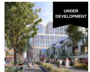
Master Planned Community