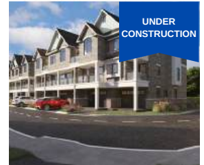
21 Luxury Townhomes