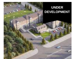
Converted Day Nursery + 50 Residential Units